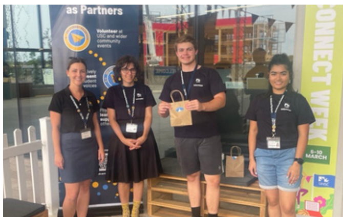
Promoting volunteer events on campus with students at UniSC.

What inspires me most is seeing these experiences translate into outcomes — from employment opportunities to lifelong friendships across disciplines. Beyond the skills gained, these connections foster belonging and enrich the overall university experience.