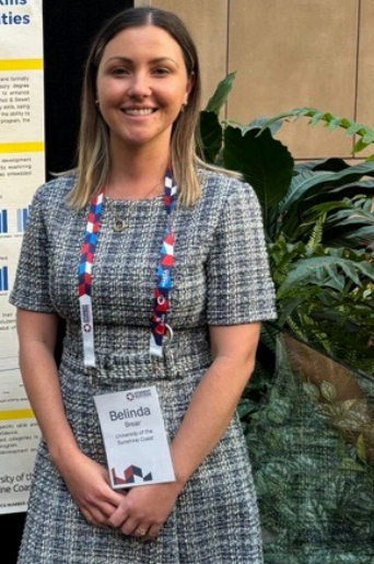
Presenting at the 2024 Student Success Conference.