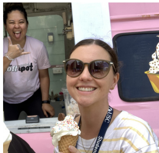
Supporting local food vans on campus - it would be rude not to really.

What strategies have you implemented to increase student involvement?